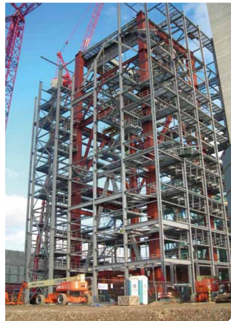
BFG PROJECT Location: Ghent (BE) Tonnage: 3.000 Client: Hitachi