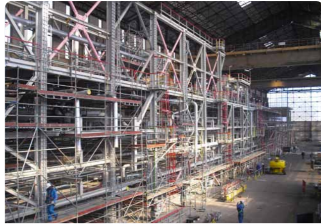
ANTWERP HIGH PRESSURE HYDROTREATER Location: Antwerp (BE) Tonnage: 1.100 Client: Esso Belgium - Fabricom GTI