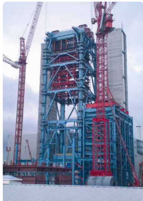
RDK8 Location: Karlsruhe (DE) Tonnage: 16.085 Client: Alstom Power Systems