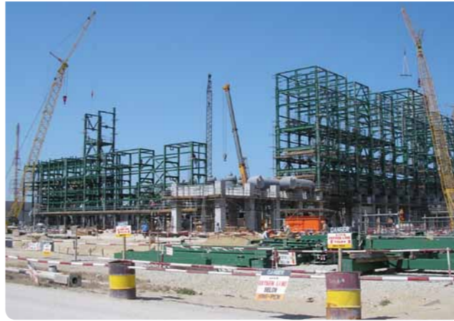
SHARQ 3RD EXPANSION PROJECT Location: Al Jubail (SA) Tonnage: 6.000 Client: Sharq - Linde KCA