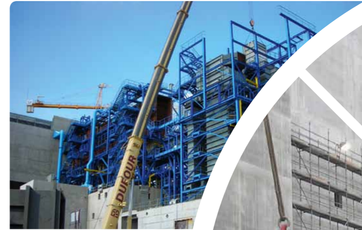
INCINERATOR Location: Dunkirk (FR) Tonnage: 500 Client: Von Roll - Inova