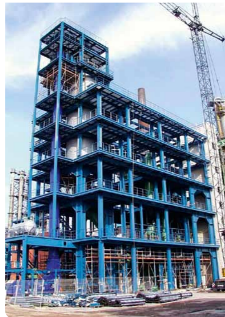
PETROCHEMICAL PRODUCTION UNIT Location: Leverkusen (DE) Tonnage: 825 Client: GE Bayer Silicones