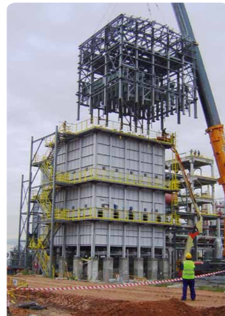
BP OIL REFINERIA Location: Castellon (ES) Tonnage: 450 Client: Technip Benelux