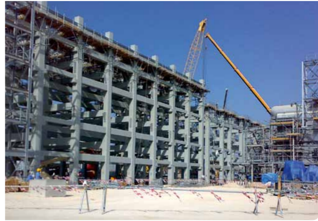
RAS GAS LNG TRAIN 6&7 Location: Ras Laffan (QA) Tonnage: 1.850 Client: Raf Laffan LNG Company