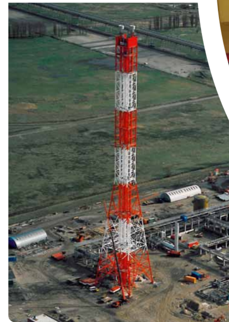
BASF FLARE Location: Antwerp (BE) Tonnage: 260 Client: Linde AG